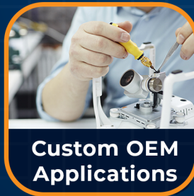
Custom OEM Applications