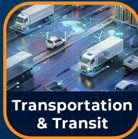
Transportation & Transit