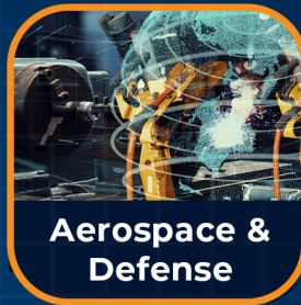
Aerospace & Defense