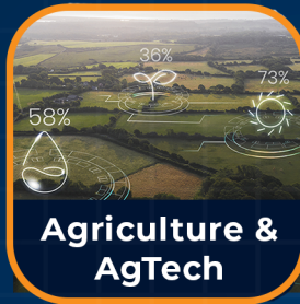
Agriculture & AgTech