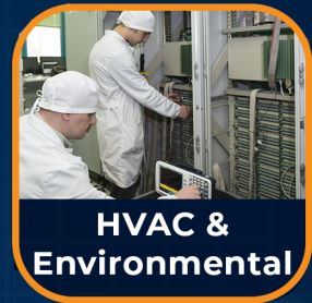
HVAC & Environmental