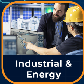
Industrial & Energy