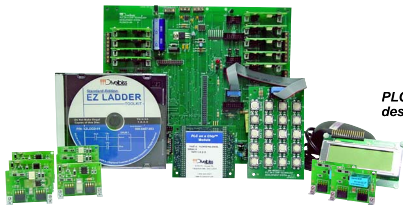
PLCDK-03 with optional keypad and display modules shown.

PLCDK-0I-4x20 4x20 LCD Display & Keypad Option for PLCDK-03