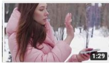
Harsh Environment Controller Family Video