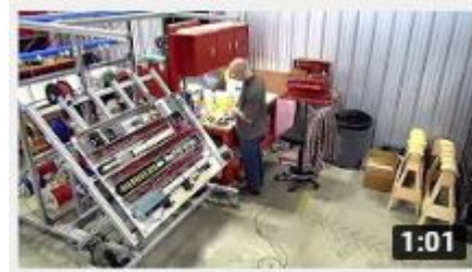
Application Spotlight Video : Greenhouse Control with IoT

→ Divelbiss partnered with Atom Ag. , a greenhouse manufacture for the development of a custom solutions control package with local and remote control (IoT). See the video to learn more.